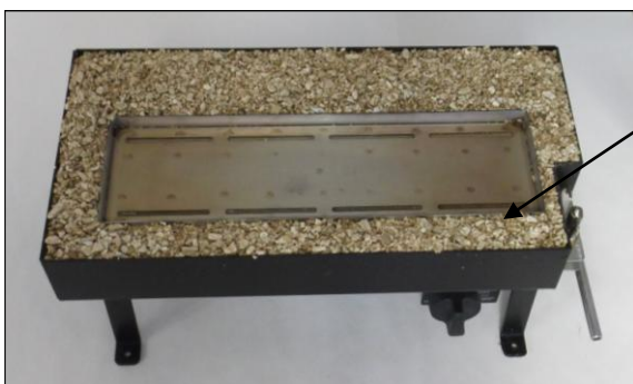
Tray filled with vermiculite and burner insulation pad recess vacuumed out but pad not fitted (shown with standard side pilot cut out)