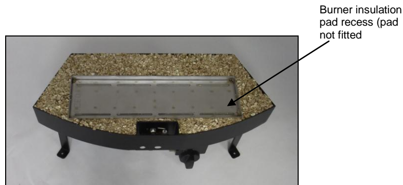
Tray filled with vermiculite and burner insulation pad Recess vacuumed out but pad not fitted

Shown with alternative central pilot cut out (used only when standard side pilot cut out is not practical).