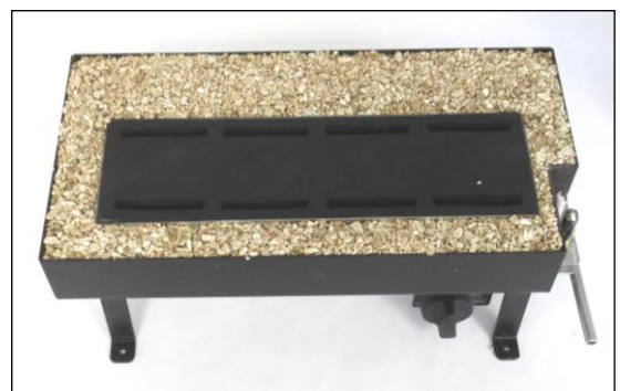
Burner insulation pad positioned ready to lay ceramics (shown with standard side pilot cut out)